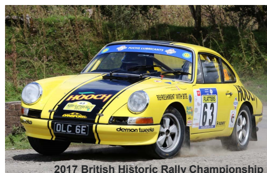
2017 British Historic Rally Championship