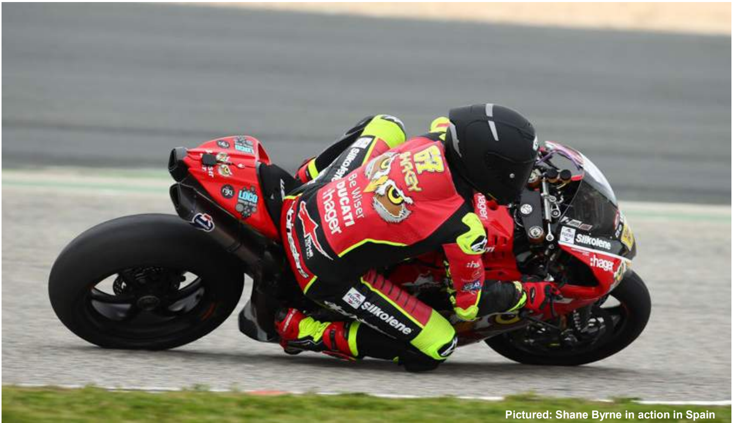
Pictured: Shane Byrne in action in Spain