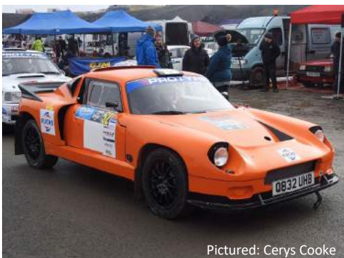
Pictured: Cerys Cooke

FUCHS lubricants: Silkolene PRO 4 PLUS SAE 10W-50, Silkolene BRAKE CLEANER SPRAY, Silkolene PRO CHAIN SPRAY, Silkolene PRO PREP SPRAY, Silkolene CHAIN CLEANER SPRAY