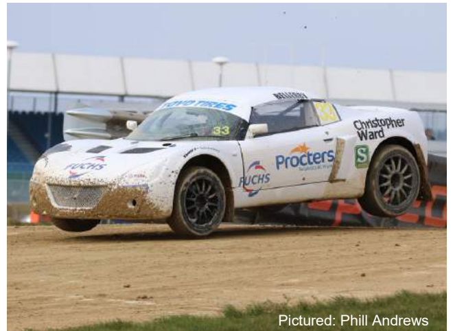
Pictured: Phill Andrews

On race day, in a line-up of 40 riders, Alfie's best result of the day was in 24th place and Grant finished 12th.