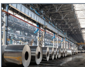
Factories & Manufacturing