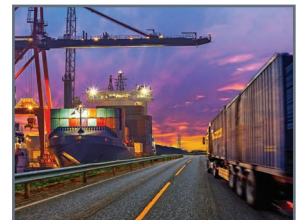
Transport: Ports, Depots