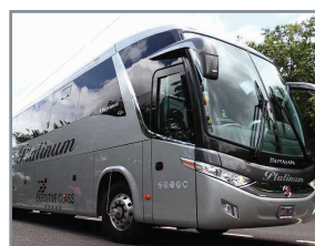
Bus & Coach