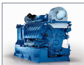
Stationary Gas Engines (CHP)